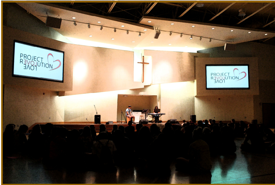
One of two mini concerts at Project Revolution