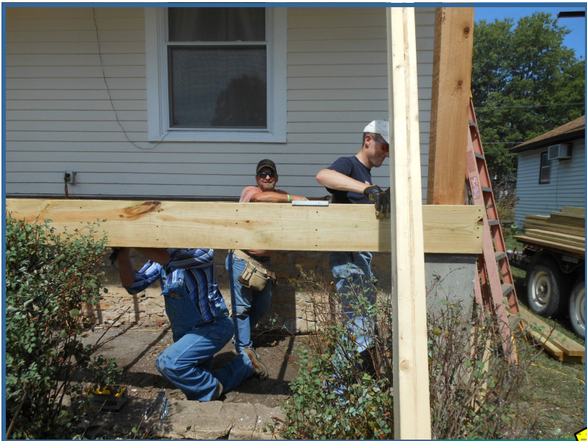
Helping Hands group working on a porch for a Garnett resident.